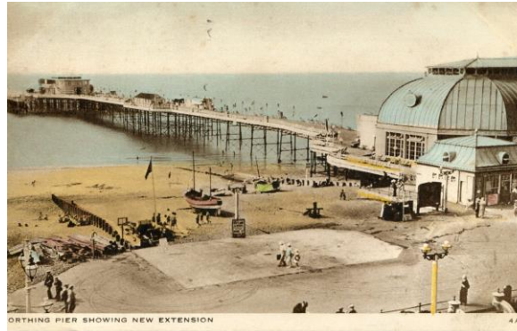
Worthing Pier 1939

Geoffrey is passionate about the Sussex landscape, with a fantastic local knowledge of its geography and evolution over millions of years.